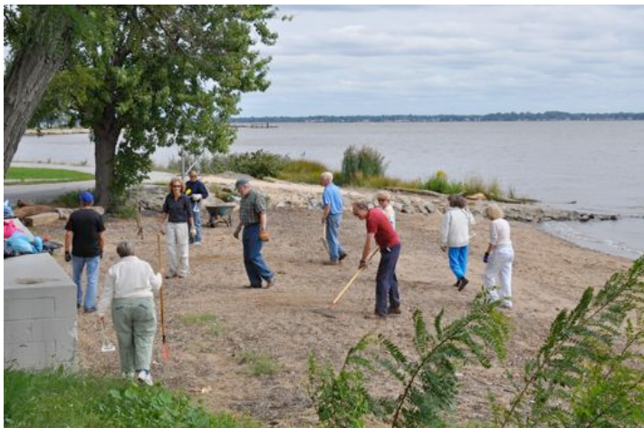
A pristine beach afterwards