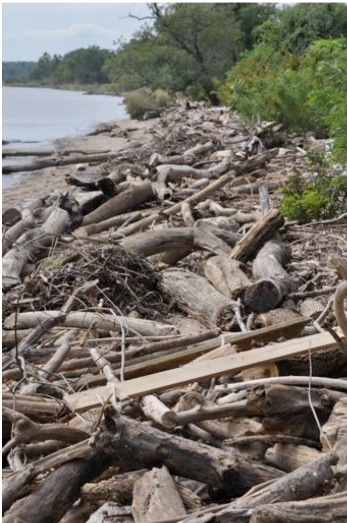
Before the clean-up