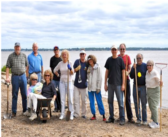
The Chain Saw Gang